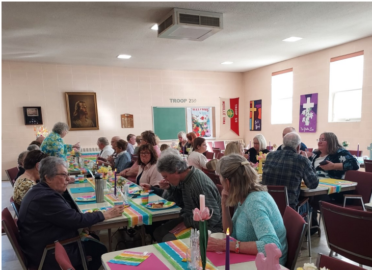
Thank you to all of those who help prepared and shared in our Easter Sunday breakfast. It was wonderful!