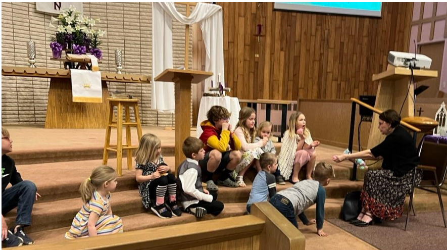
Young Disciples helping Pastor tell the Easter story from the contents of their Easter Eggs.